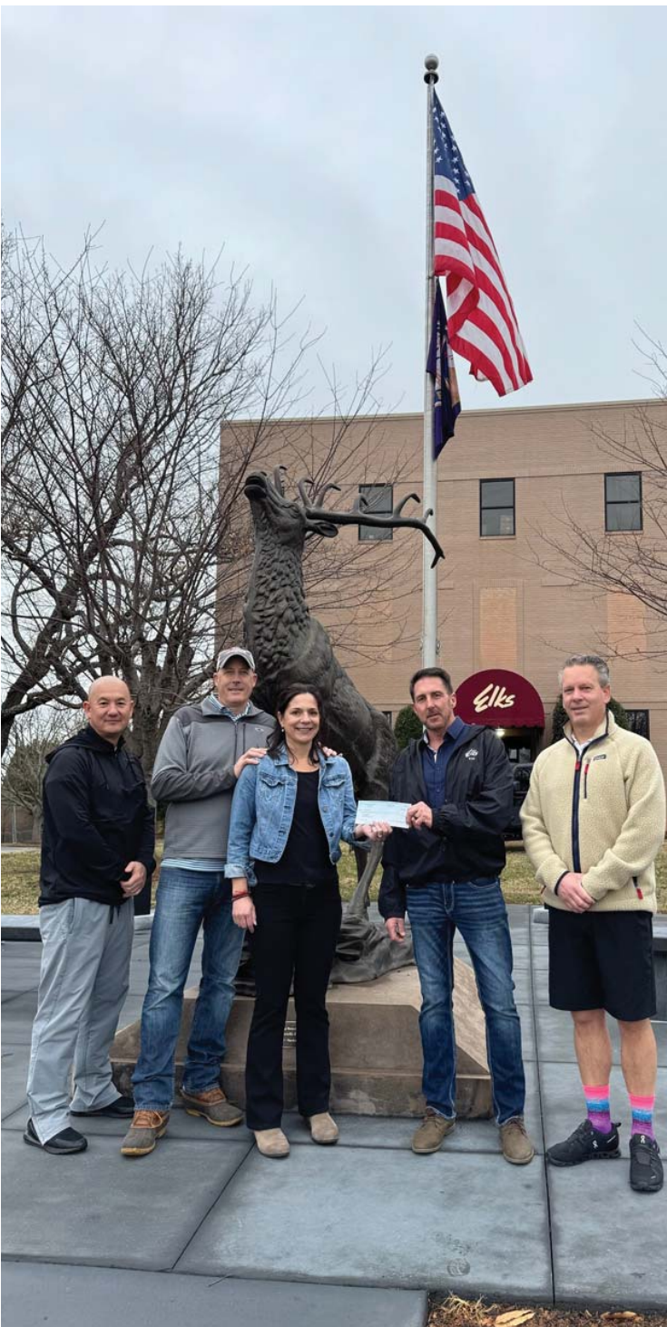
Donation to the Salunda Pantry