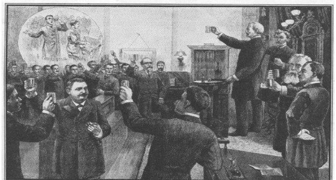
The 11 o'clock toast to the absent: an Elk custom

Happy to report that no sickness or distress reported this past period. Wish continued health & happiness to all